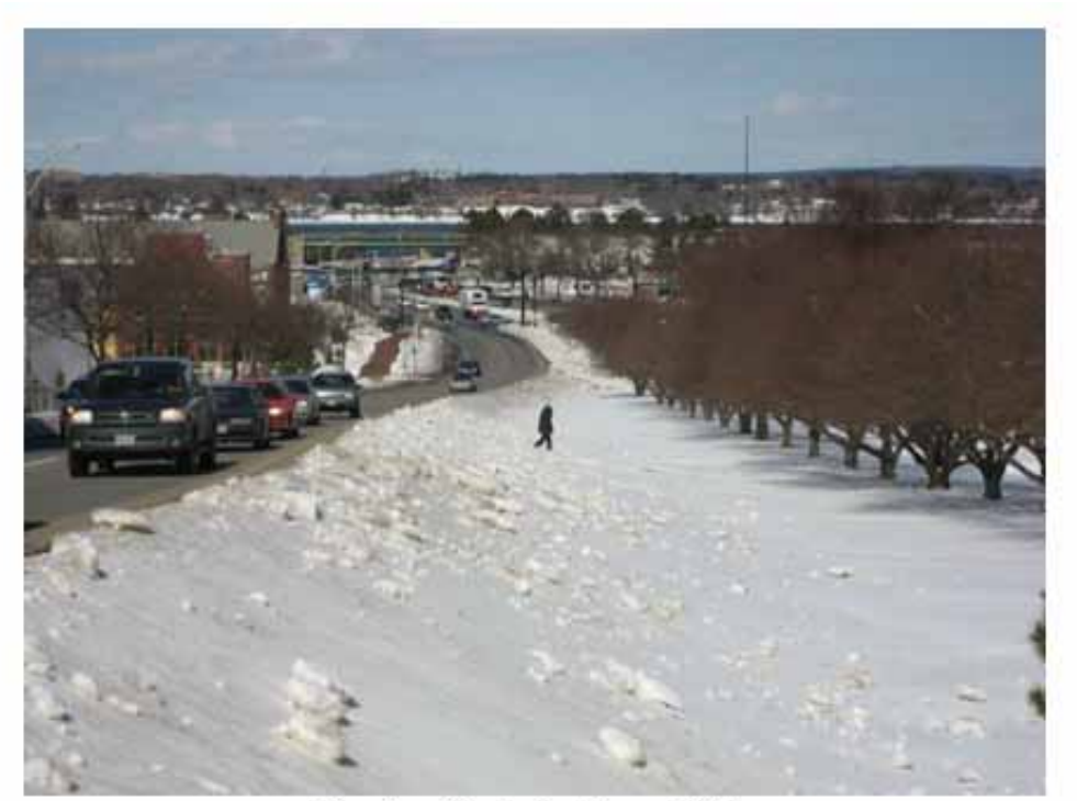
View from Cumberland toward 295

The first step was to seek consensus on defining "the problem." Participants in 5 breakout groups created group "Problem Statements." The 5 Problem Statements were then synthesized into one, and edited by consensus, to create our final Problem Statement: